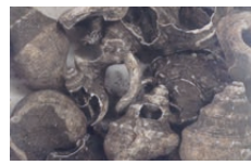
Midden samples found between Parton Road and Bell Road

The TEL is within the rohe (territory) of Nga Potiki a Tamapahore and Te Arawa tribes including Ngati Whakaue ki Maketu, Tapuika Iwi and Waitaha Iwi. Other tribes such as Ngai Te Rangī, Ngati Pukenga and Ngati He have an historical association within the TEL and each of these tribes are represented on the Tauranga Eastern Link Tangata Whenua Advisory Group.