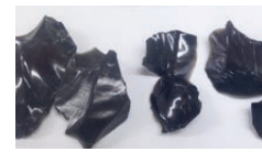
Pungapunga found at Otaimatua Pa SH2