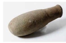
A Patu Muka found around the Kaituna river (for pounding flax)