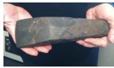
Argillite Toki/adze found at Hungahungatoroa Pa alongside SH2 near Domain Road interchange (est 600 years old)