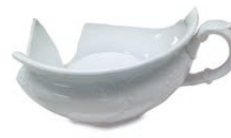
A chamber pot found between Parton Road and Bell Road