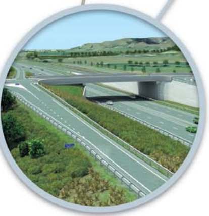
2. Mangatawa interchange