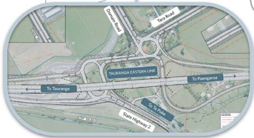
3. Domain Road interchange