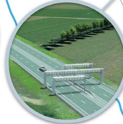
6. Proposed toll collection point