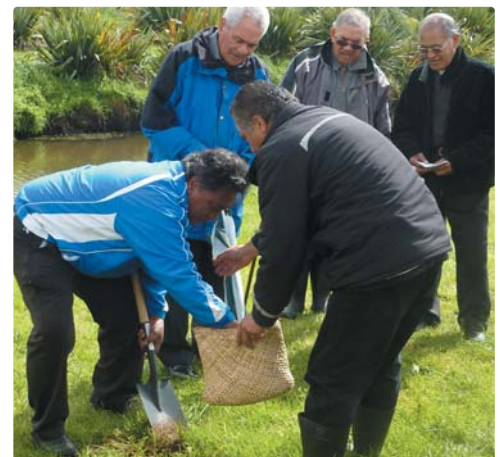
Tangata whenua from Ngati Whakaue, Tapuika and Waitaha lead the blessing ceremony alongside the Kaituna River.