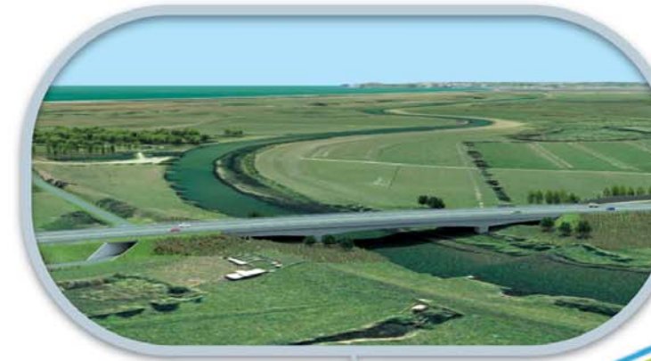
5. Kaituna River Bridge and Bell Road underpass