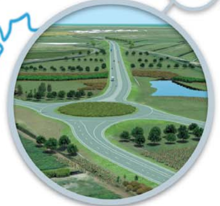
8. Paengaroa roundabout