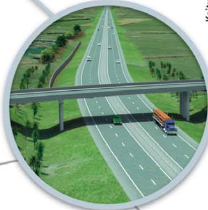
4. Parton Road overbridge