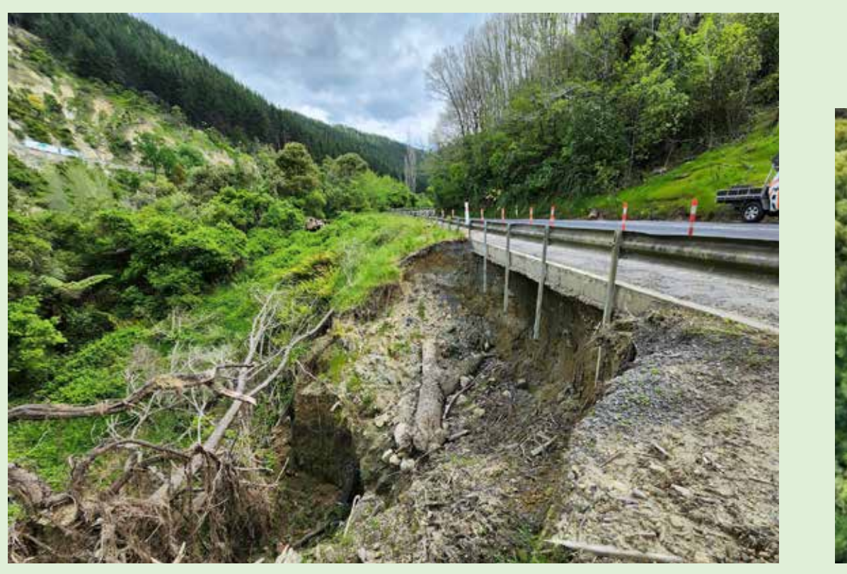
Damage at the Devil's Elbow from Cyclone Gabrielle

Capturing and diverting stormwater and sediment would help to prevent further erosion and underslips.