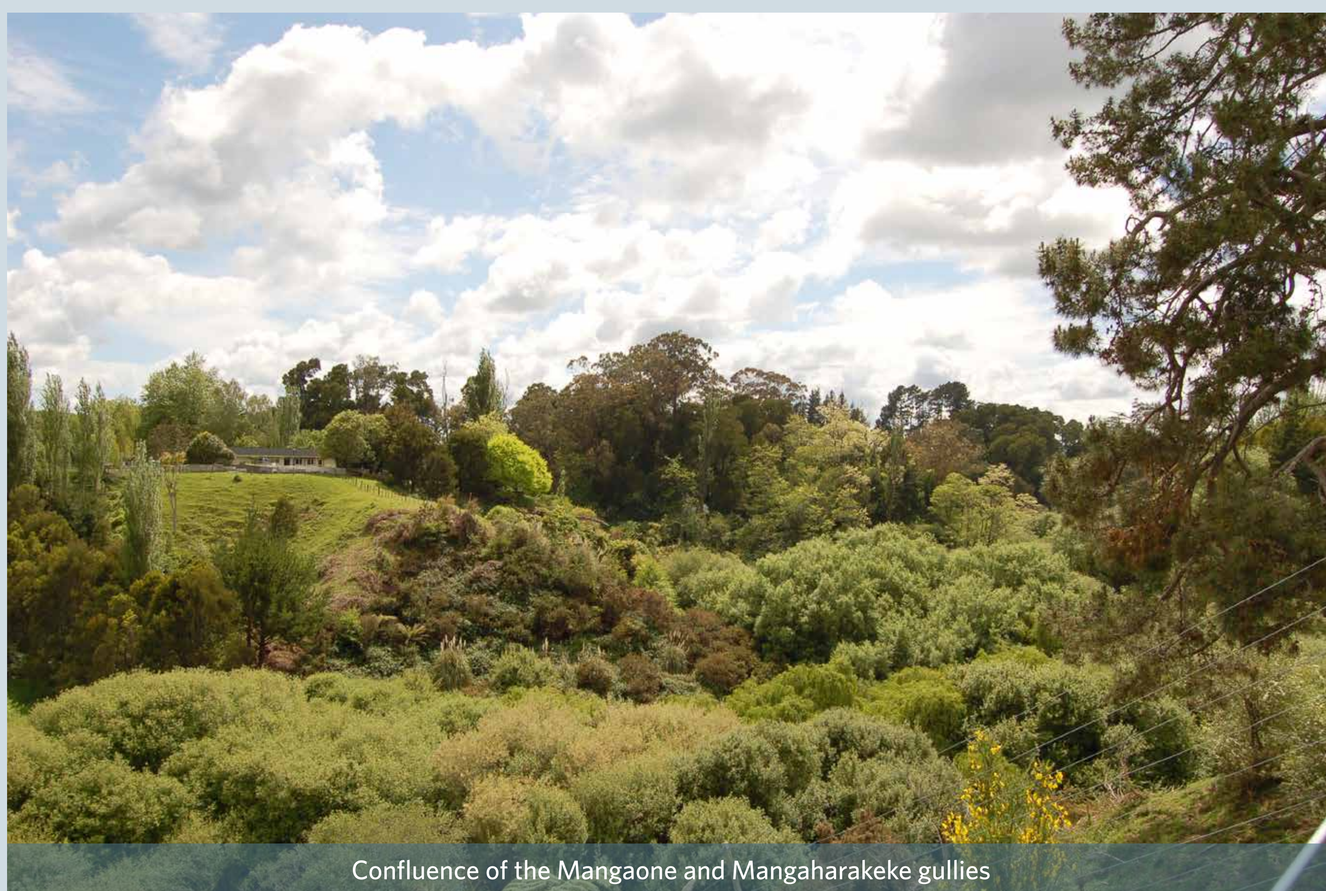
Confluence of the Mangaone and Mangaharakeke gullies