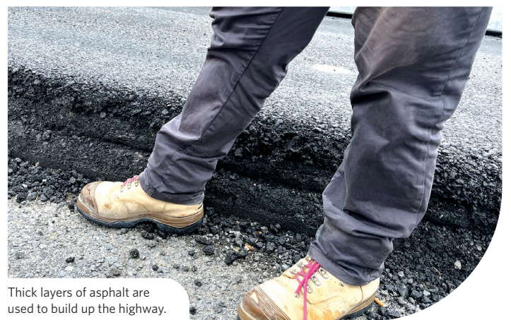
Thick layers of asphalt are used to build up the highway.

The works are expected to finish in mid-2025 although the Transport Agency and its contractors are continuing to look at programming and resources to finish the job earlier.