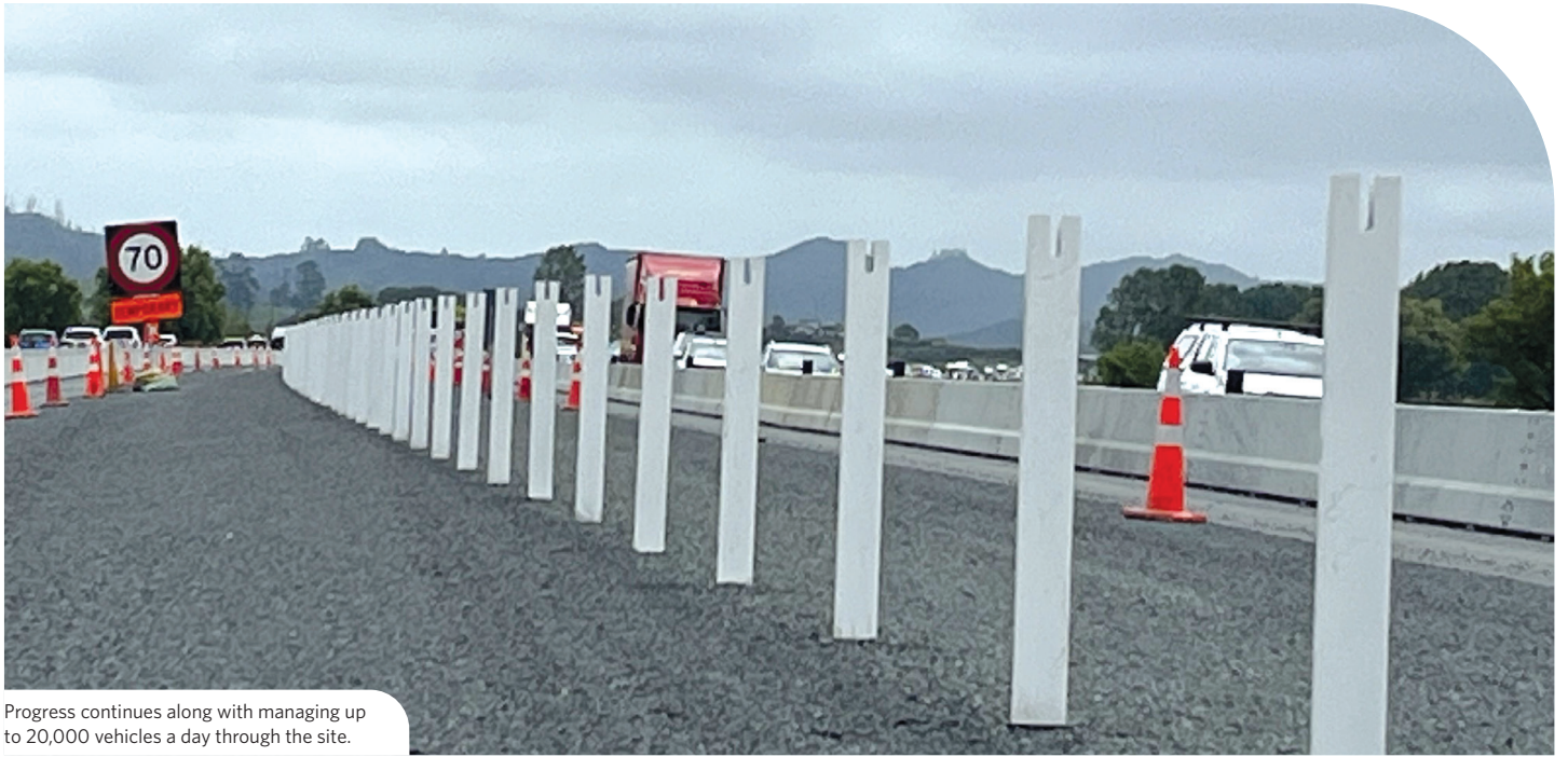
Progress continues along with managing up to 20,000 vehicles a day through the site.

We are working to bring the Ngāruawāhia section of the expressway up to the same standard as its neighbouring 110km/h sections, and work has accelerated this summer.