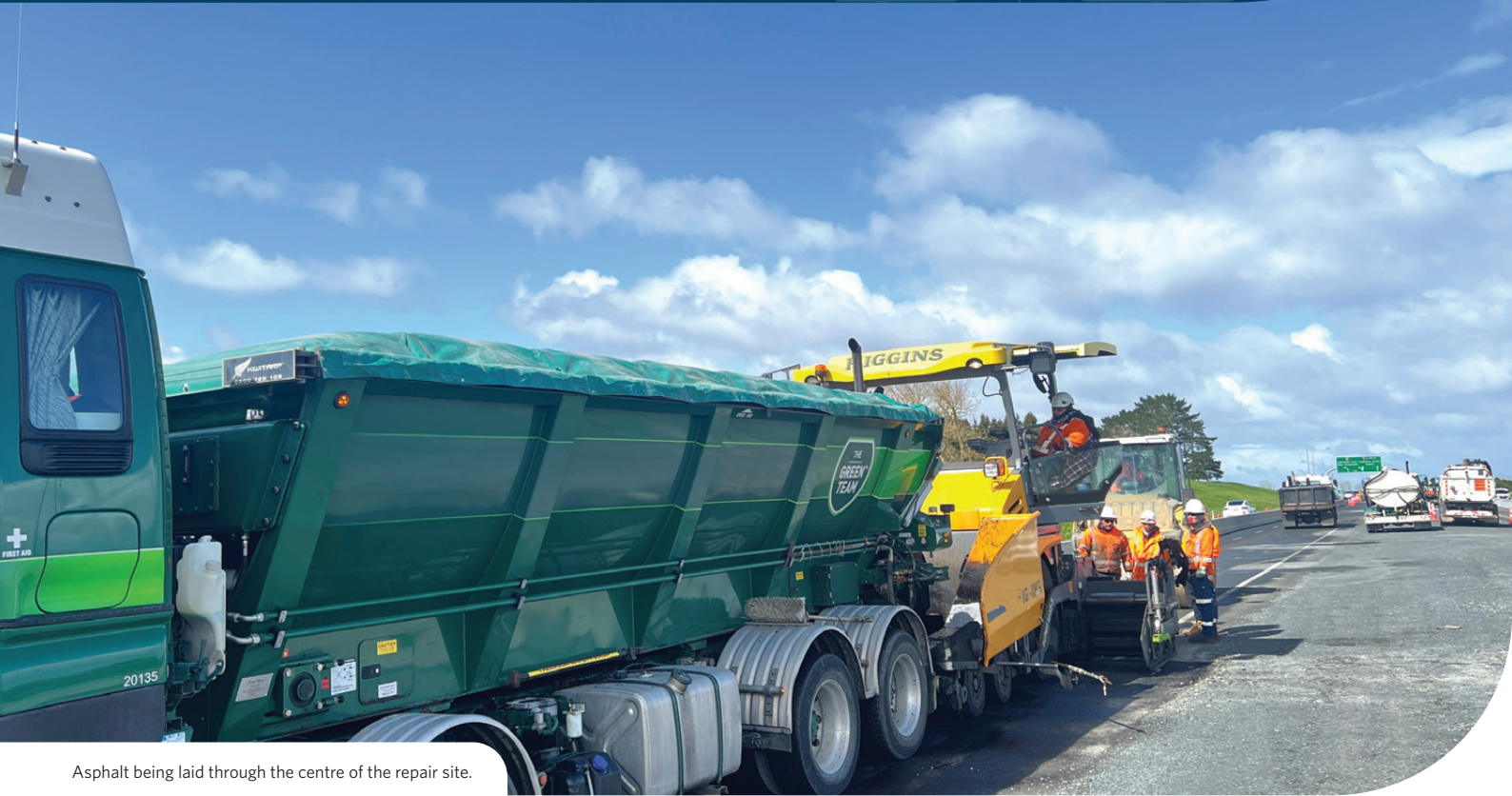
Asphalt being laid through the centre of the repair site.