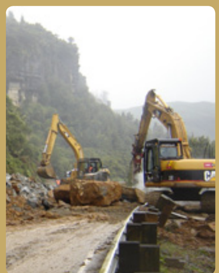
Waikato maintenance contract