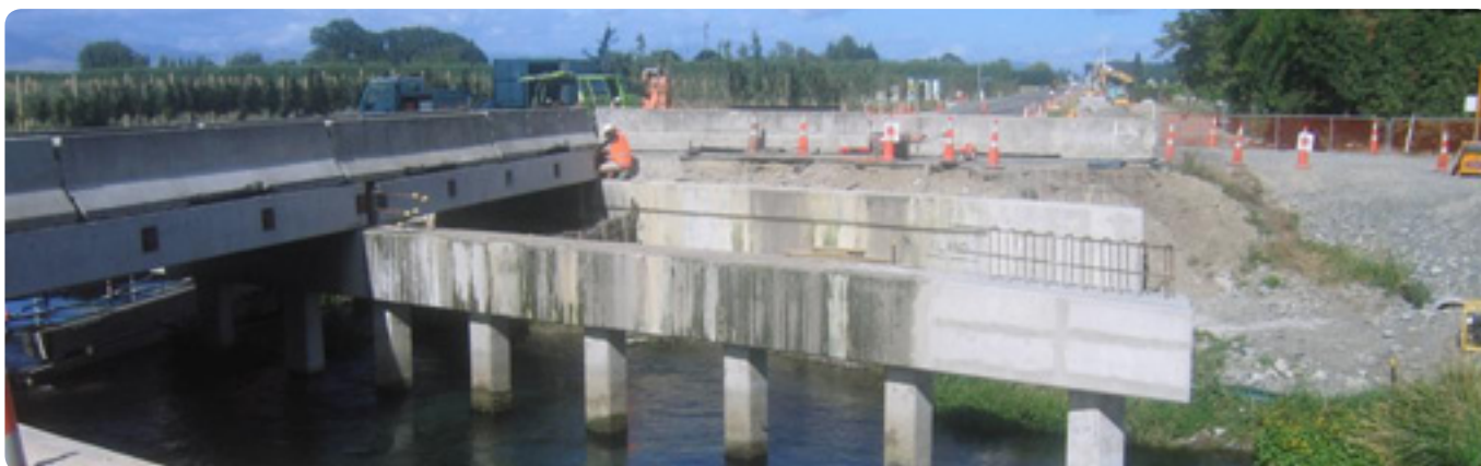
Murphys Bridge SH62 (Marlborough)