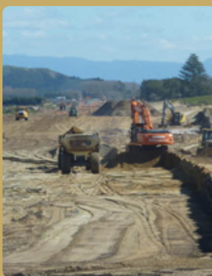
Tauranga Eastern Link