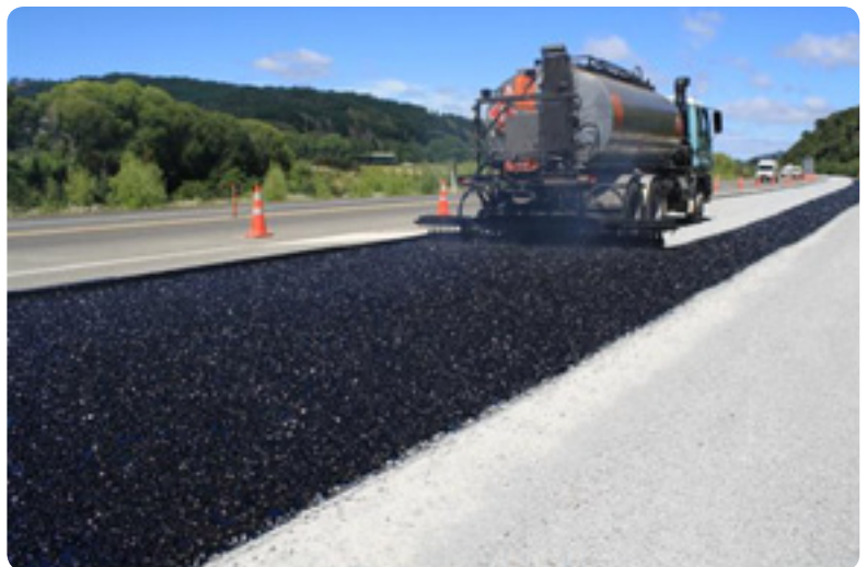
Widening of SH2 at Silverstream (Wellington)