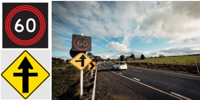
Figure 2: Intersection speed zone signs

The intersection speed zone is designed to instruct motorists of a lower speed limit when potential conflict situations exist (that is, the presence of a vehicle waiting at a side road or an opposing right-turning vehicle on the main road). This instruction is achieved by potentially conflicting vehicles triggering side-road or right-turn bay sensors and activating the electronic signs on the main road.