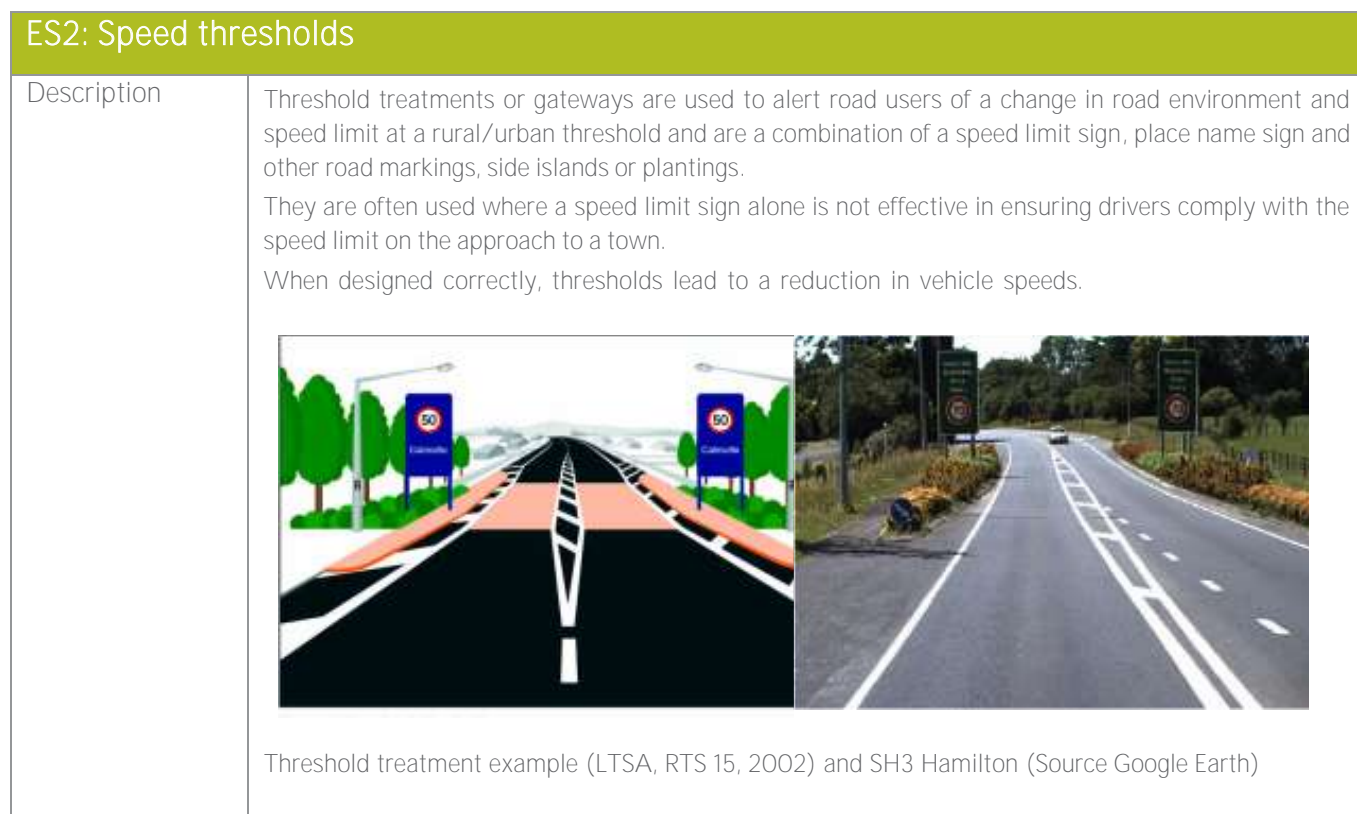
Figure 3: Threshold treatments

Thresholds are useful where, for example, the change in roadside development is not immediately obvious on approach and the threshold can be used to reinforce this change. However, a threshold treatment alone does not meet the requirement in the Land Transport Rule: Setting of Speed Limits 2021 for an obvious change in roadside development and road environment.