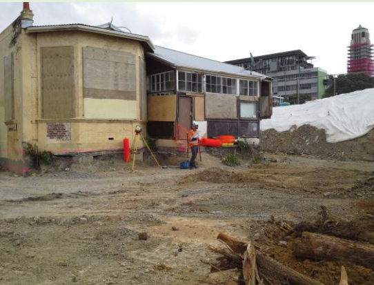
Left: Ground being levelled prior to relocating the building

If you would like to be added to our email list for information, please contact us on info@memorialpark.co.nz .