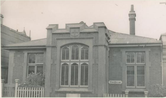
Above: Home of Compassion Crèche, showing the brickwork before it was painted

The historic Home of Compassion Crèche building on the corner of Buckle St will be restored and will become a feature of the National War Memorial Park.